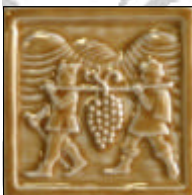
4x4 Harvest, Dijon