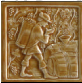
6x6 Winemaker, Dijon