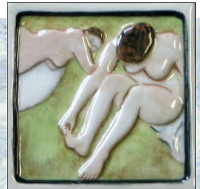
4x4 Bathers, Standard Painted