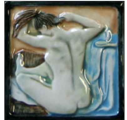
4x4 Combing Hair, Standard Painted