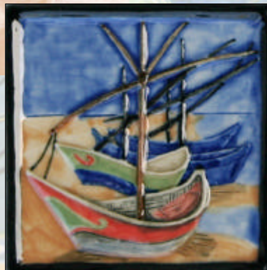
4x4 Boats - Standard Painted