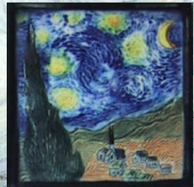
4x4 Starry Tile - Standard Painted