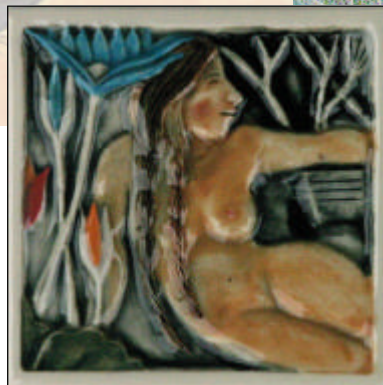
4x4 The Dream - Standard Painted

55 WEST GRANT STREET POST OFFICE BOX 14 HEALDSBURG, CA 95448 TEL 707 433 8866 FAX 707 433 0548 WWW.MCINTYRE-TILE.COM