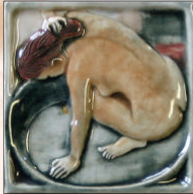
4x4 The Tub - Standard Painted

Impressionist Art Tiles are available in hundreds of McIntyre's standard glazes or hand painted to replicate original works of art.