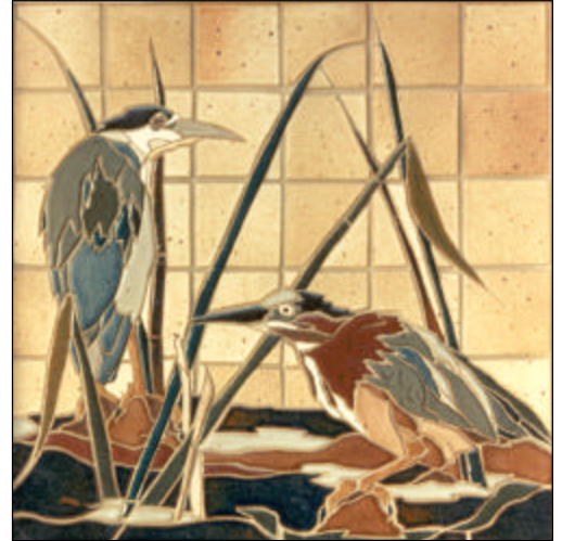
Night Heron Mural, 18" x 18" 3x3 field tiles - Various Glazes