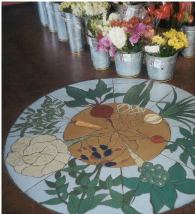
Custom Cut Tile Mural, 6' Diameter