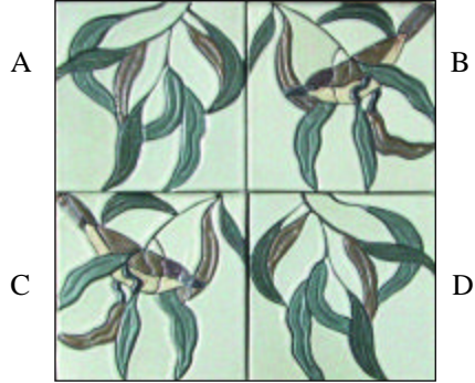
A-6x6 Eucalyptus I, B-6x6 Yellowthroat-L, C-6x6 Yellowthroat-R and D-6x6 Eucalyptus II.