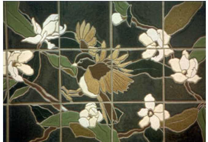
Custom Sparrow in Magnolia Mural, 6x6 tile field.